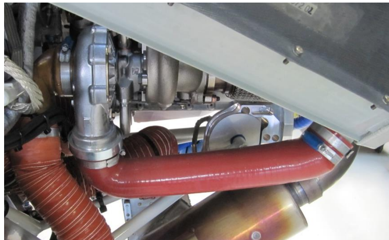
Figure 1: turbocharger hose, installed

◆ Note: Please contact Continental Aerospace Technologies GmbH for queries regarding hoses affected.