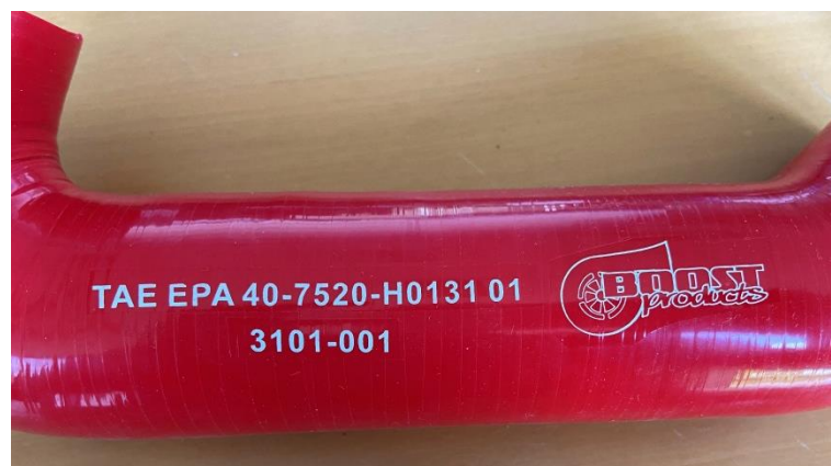
Figure 2: turbocharger hose of batch 3101-001